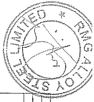
Table II - STATEMENT SHOWING SHAREHOLDING PATTERN OF THE PROMOTER AND PROMOTER GROUP