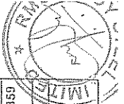
Table II - STATEMENT SHOWING SHAREHOLDING PATTERN OF THE PROMOTER AND PROMOTER GROUP