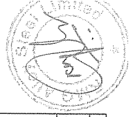
Table III - STATEMENT SHOWING SHAREHOLDING PATTERN OF THE PUBLIC SHAREHOLDER